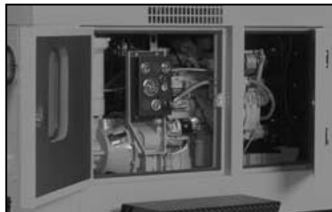
Hinged, lockable doors provide access to operating controls and service locations.

The Critically Silenced unit is engineered from start to finish for quiet operation. The enclosure consists of 14 gauge sheet metal lined with 1" and 2" (25mm and 50mm) layers of polydamp acoustical sound deadening material. We've designed the engine with a critical grade silenced muffler, silenced the priming exhaust, and isolated engine vibration to further reduce operating noise. Hinged, lockable doors provide convenient access to operating controls and service locations. For added versatility, the entire skid mounted unit can be unbolted and removed from the DOT highway trailer.