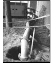
CD150M 6" (150mm) Dri-Prime for Stormwater Sewer Bypass