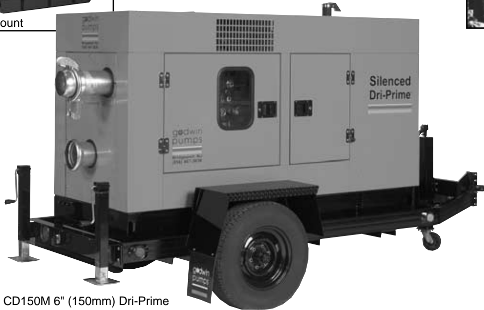
CD150M 6" (150mm) Dri-Prime Trailer Mount

The Critically Silenced enclosure houses the versatile Dri-Prime CD range and HL range pumps in a specially designed, acoustically-silenced enclosure. The Critically Silenced unit is intended for use in any application where pumping is required and engine and other noise must be kept to a minimum. Sound levels are approximately 69 dBA at 30 feet (9 meters).